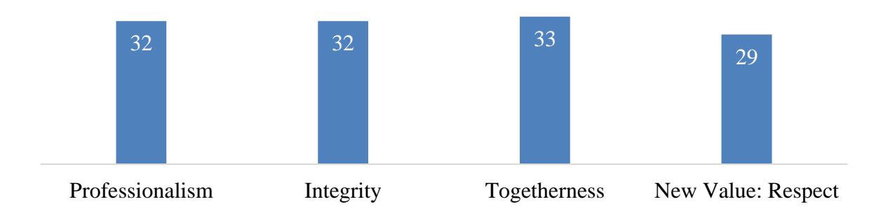
Figure 3 . Number of Respondents Stating Values Covered in OIC-StatCom Strategic Vision 2020 and New Proposed Value are Relevant for the Strategic Vision 2030

Concerning the Values to be included in OIC-StatCom Strategic Vision 2030, almost all countries agreed on the relevancy of the Values stated currently in the OIC-StatCom Strategic Vision 2020 and on the new proposed value "Respect".