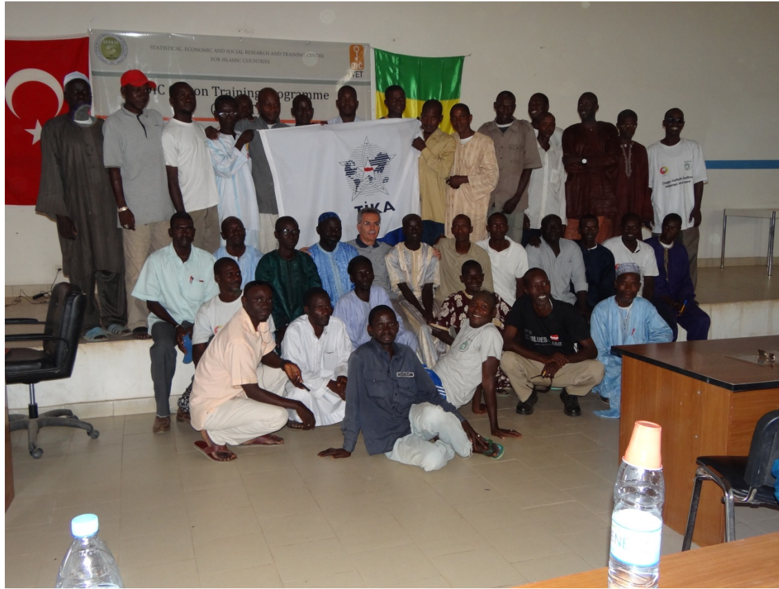
15-17 November 2011, KOLDA / SENEGAL Training Course on 'Plant Protection: Insects'