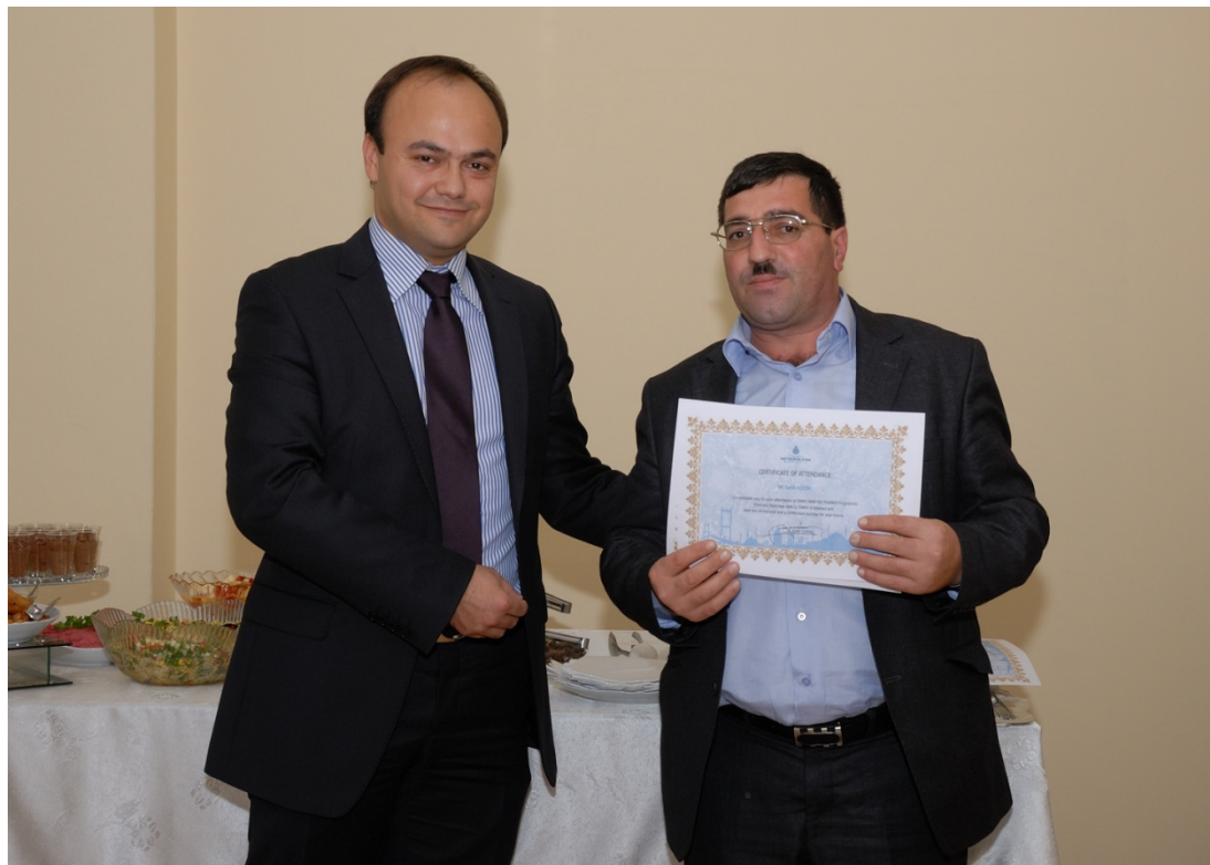
24 – 28 OCTOBER 2011, ISTANBUL / TURKEY Certificate Ceremony of the Master Trainers from Republic of Azerbaijan