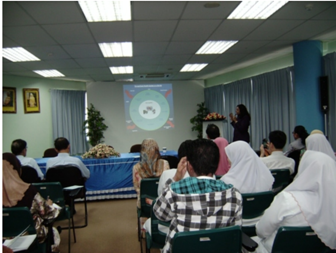
19-21 April 2011, BANDAR SERI BAGAWAN / BRUNEI Training Course on 'Occupational Health and Safety'