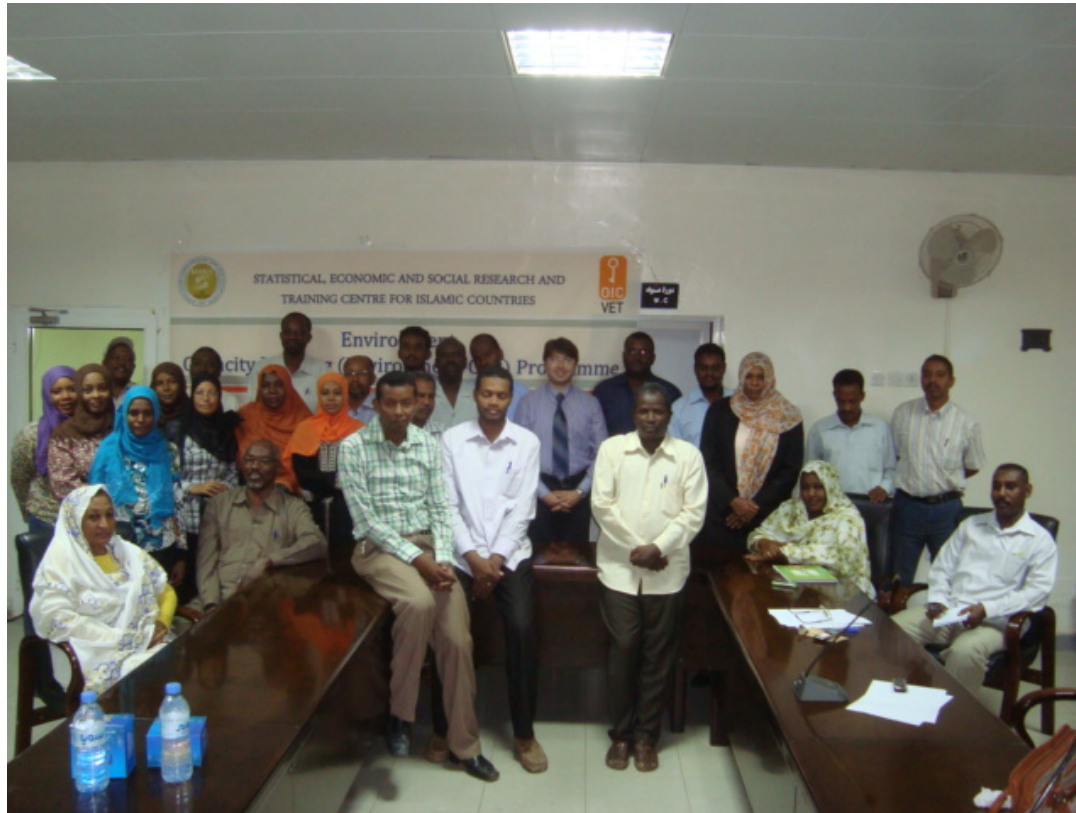
23-24 November 2011, KHARTOUM / SUDAN Training Course on 'Water Resources Management'