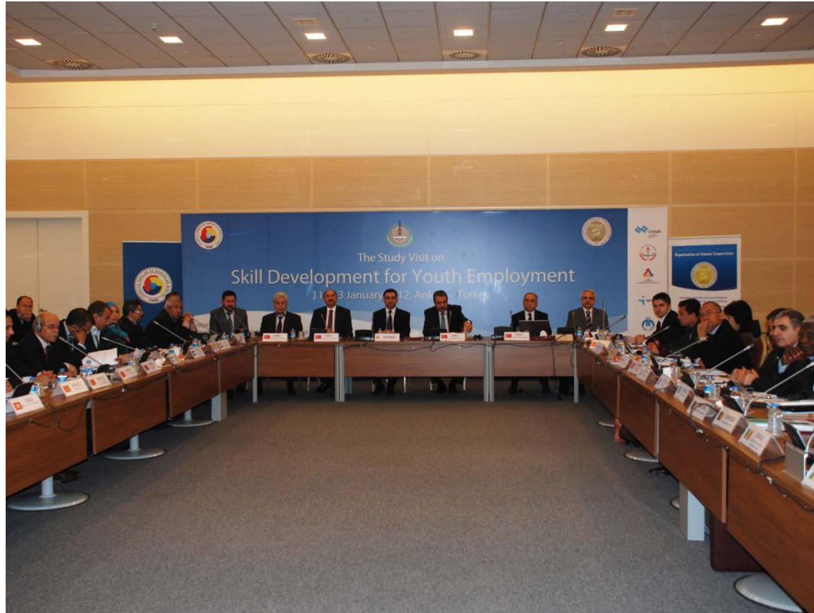
11-13 January 2012, ANKARA / TURKEY Study Visit on Skill Development for Youth Employment