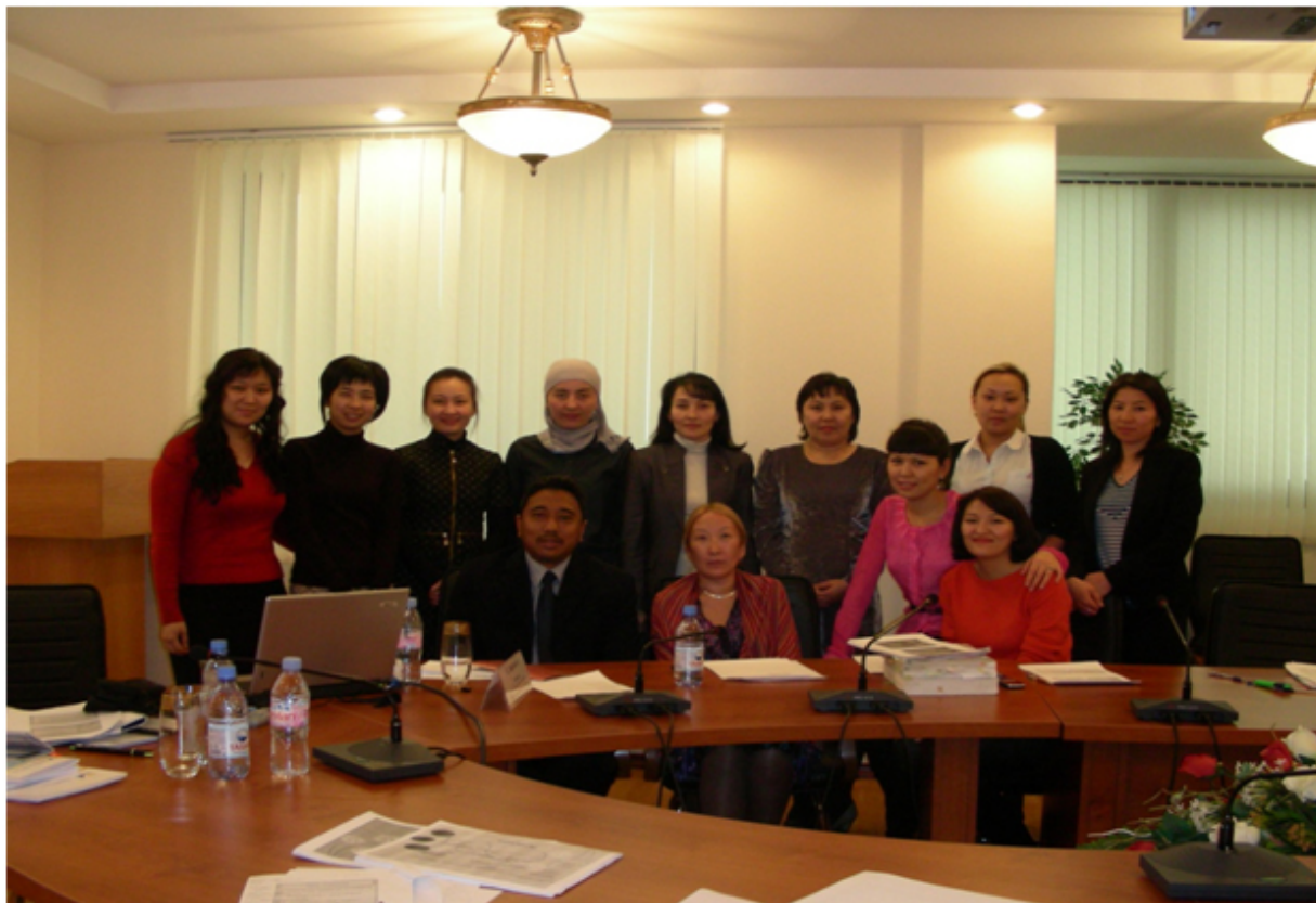
31 October - 02 November 2011, ASTANA / KAZAKHSTAN Training Course on 'Quarterly National Accounts'