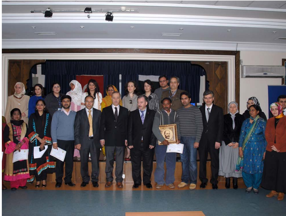
21 MARCH – 1 APRIL 2011, ISTANBUL / TURKEY Certificate Ceremony of the Master Trainers from Islamic Republic of Pakistan