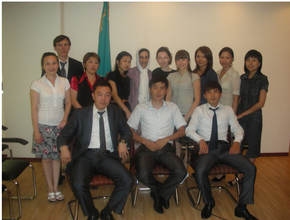
18-21 July 2011, ASTANA / KAZAKHSTAN Training Course on 'Statistical Data Analysis'