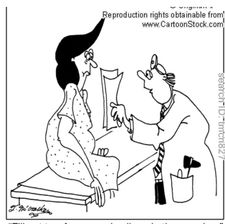
"Fill out two forms, and call me in the morning