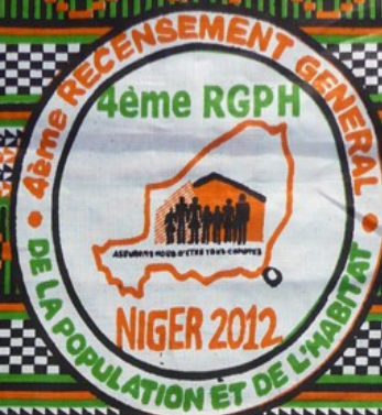
Fig 1. Map of Niger