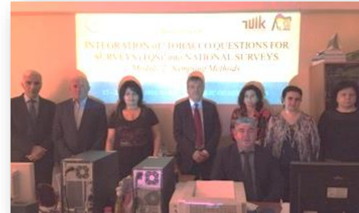
'Integration of TQS – Module 1: Sampling Methods' in Azerbaijan

November 2015, Provider: TurkStat of Turkey