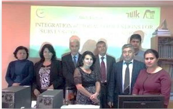
'Integration of TQS – Sampling Methods' in Azerbaijan

November 2015, Provider: TurkStat of Turkey