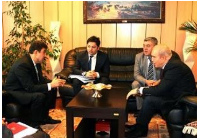
'GATS and Turkish Health Survey' in Turkey

April 2016, Beneficiary: BPS-Statistics Indonesia