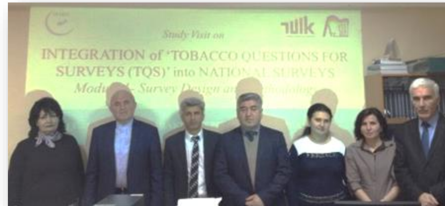
'Integration of TQS – Module 2: Survey Design and Methodology' in Azerbaijan

April 2015, Provider: TurkStat of Turkey