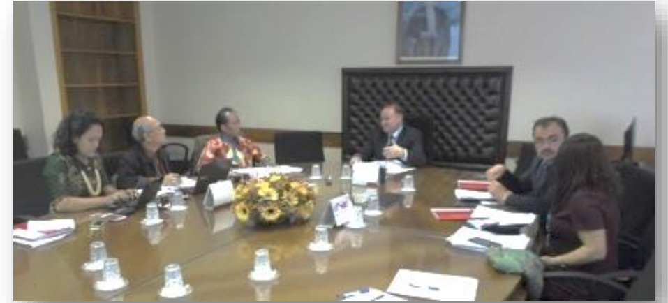
'GATS and Turkish Health Survey' in Turkey

May 2016, Beneficiary: Agency on Statistics of Tajikistan