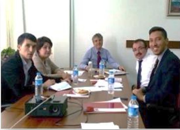
'GATS and Turkish Health Survey' in Turkey

May 2016, Beneficiary: Agency on Statistics of Tajikistan